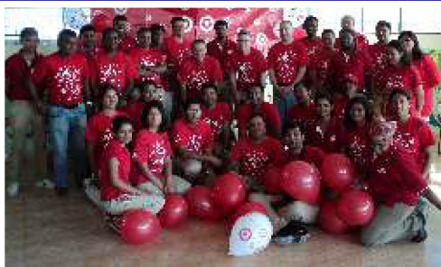
Target volunteers at YuvaLok