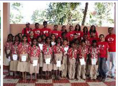
Sports with Thomson Reuters