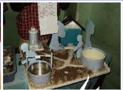
Science project on Pollution