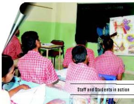
Staff and Students in action

YuvaLok's leaders must do more than overcome the pressures and challenges of running a demanding organization. They must operate the programs in a way that is ethical and reflective of our core values. In a