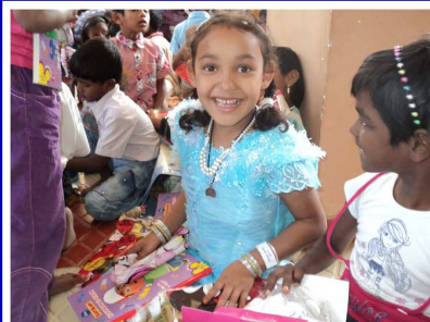
Children excited with their Christmas presents