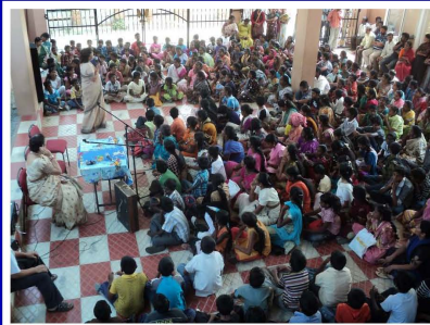
Parents Teacher's meeting in Progress