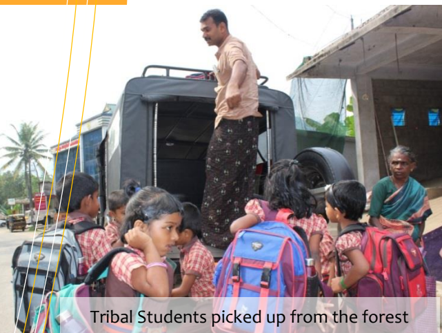
Tribal Students picked up from the forest

For the community, counseling for parents and students is regularly being done. Seminars on education, parenting, time and money managements are being organized both for parents and the local tribals. YuvaLok and MECT have opened a community center for the local people and even for the government bodies to conduct their meetings.