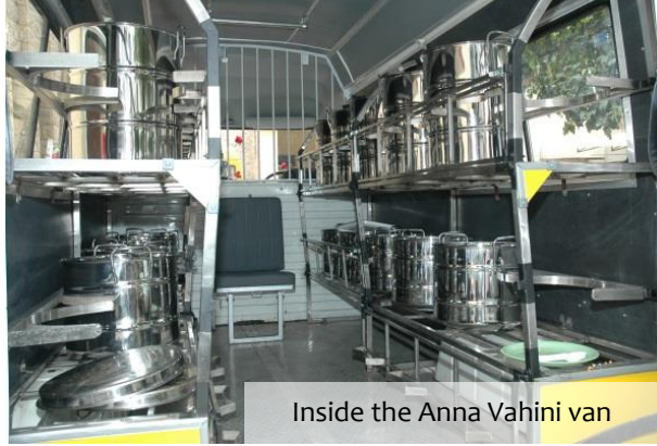
Inside the Anna Vahini van