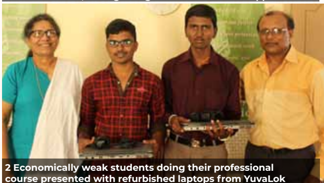
2 Economically weak students doing their professional course presented with refurbished laptops from YuvaLok