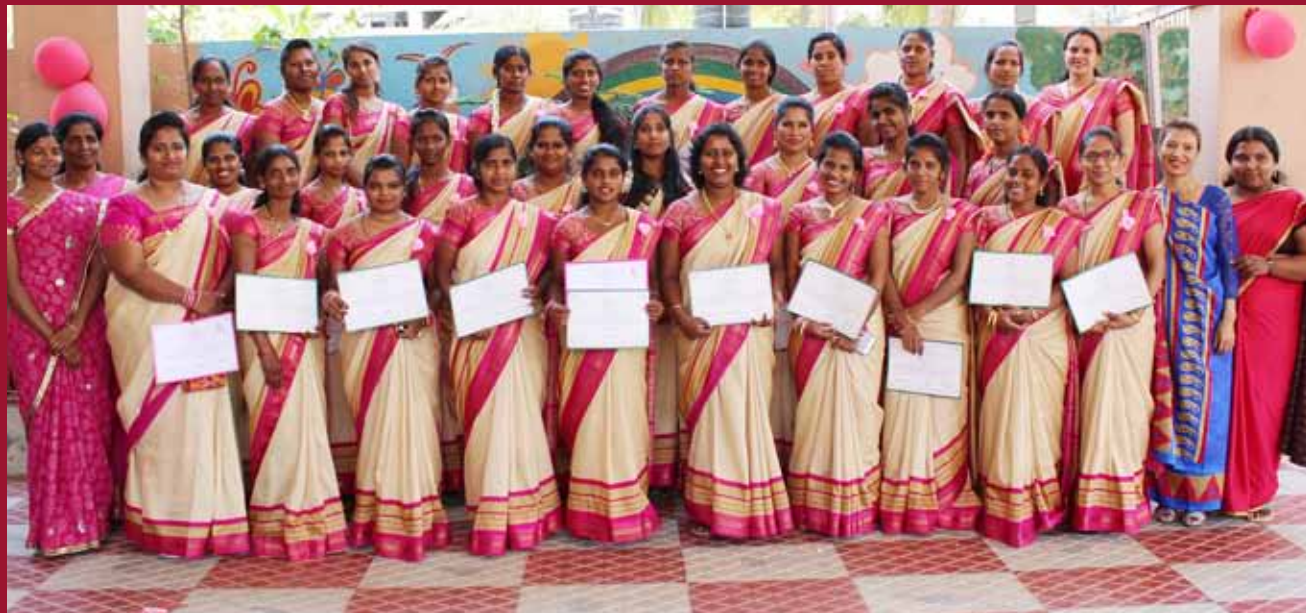
Tailoring and Beautician Trainees Graduation