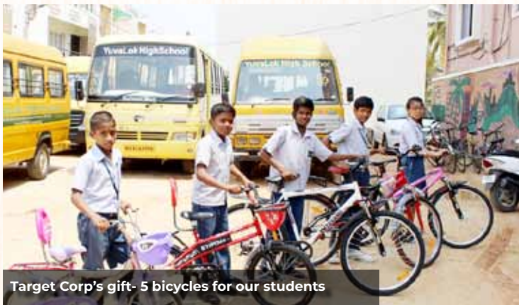
Target Corp's gift- 5 bicycles for our students