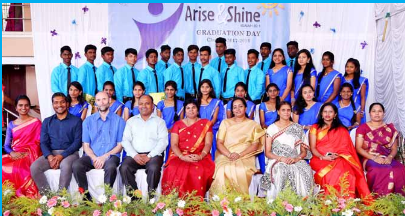
Graduating students of standard X with their teachers