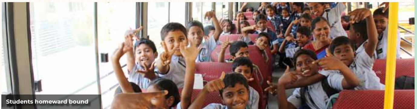
Students homeward bound