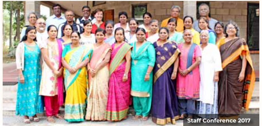
Staff Conference 2017