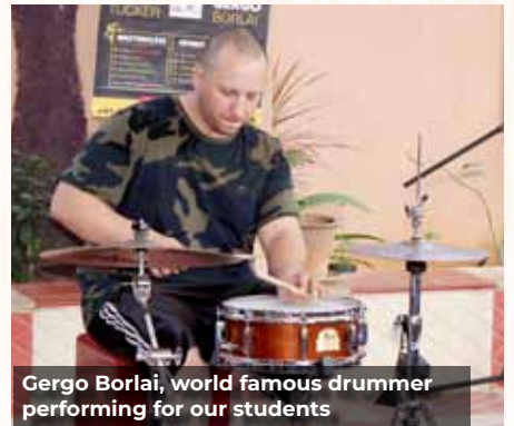
Gergo Borlai, world famous drummer performing for our students