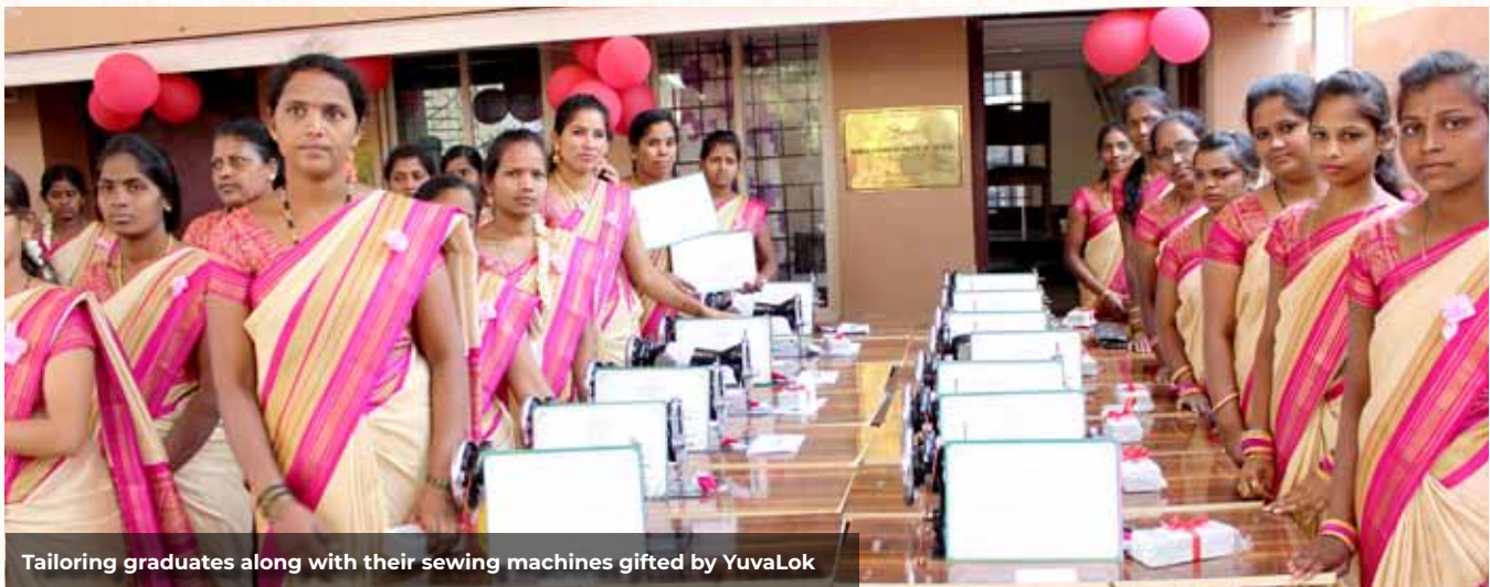
Tailoring graduates along with their sewing machines gifted by YuvaLok