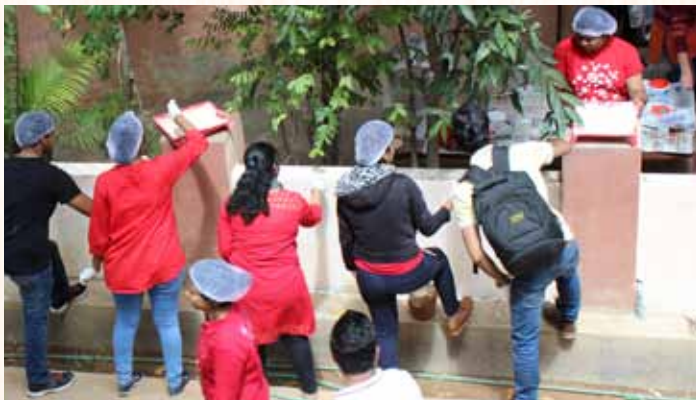
Children's dining area getting a coat of paint from Target corp Volunteers.