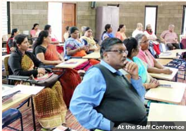
At the Staff Conference