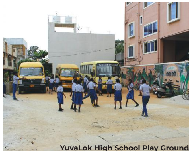
YuvaLok High School Play Ground