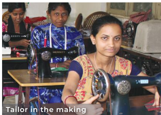
Tailor in the making