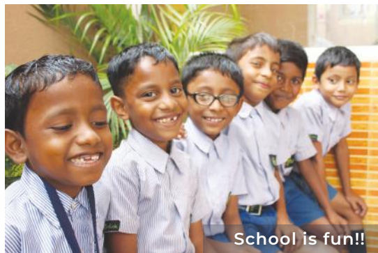
School is fun!!