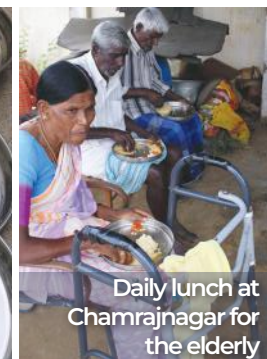
Daily lunch at Chamrajnagar for the elderly