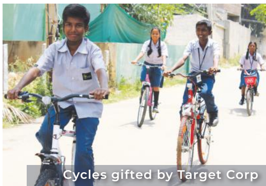
Cycles gifted by Target Corp