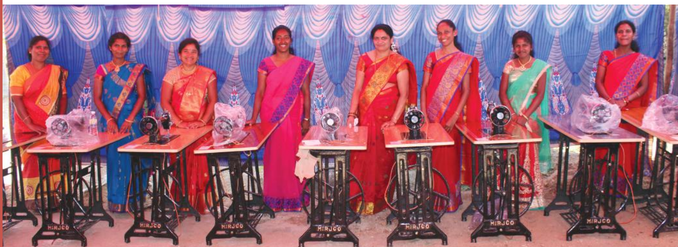
Graduation of First Tailoring Course at Bhavikere, Chickmagalur Dist (Rural)