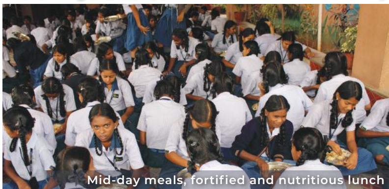
Mid-day meals, fortified and nutritious lunch