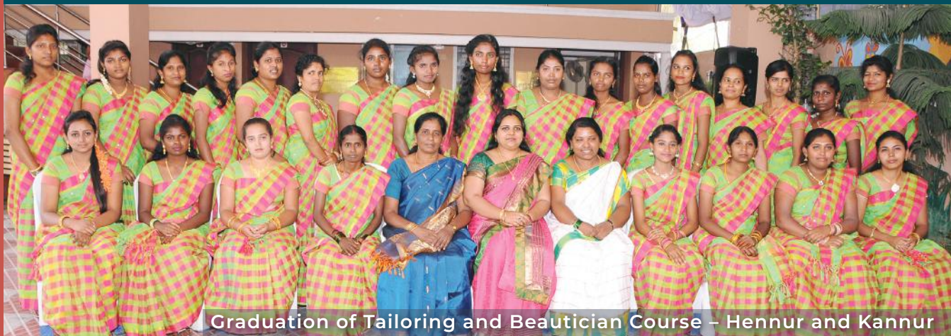
Graduation of Tailoring and Beautician Course – Hennur and Kannur