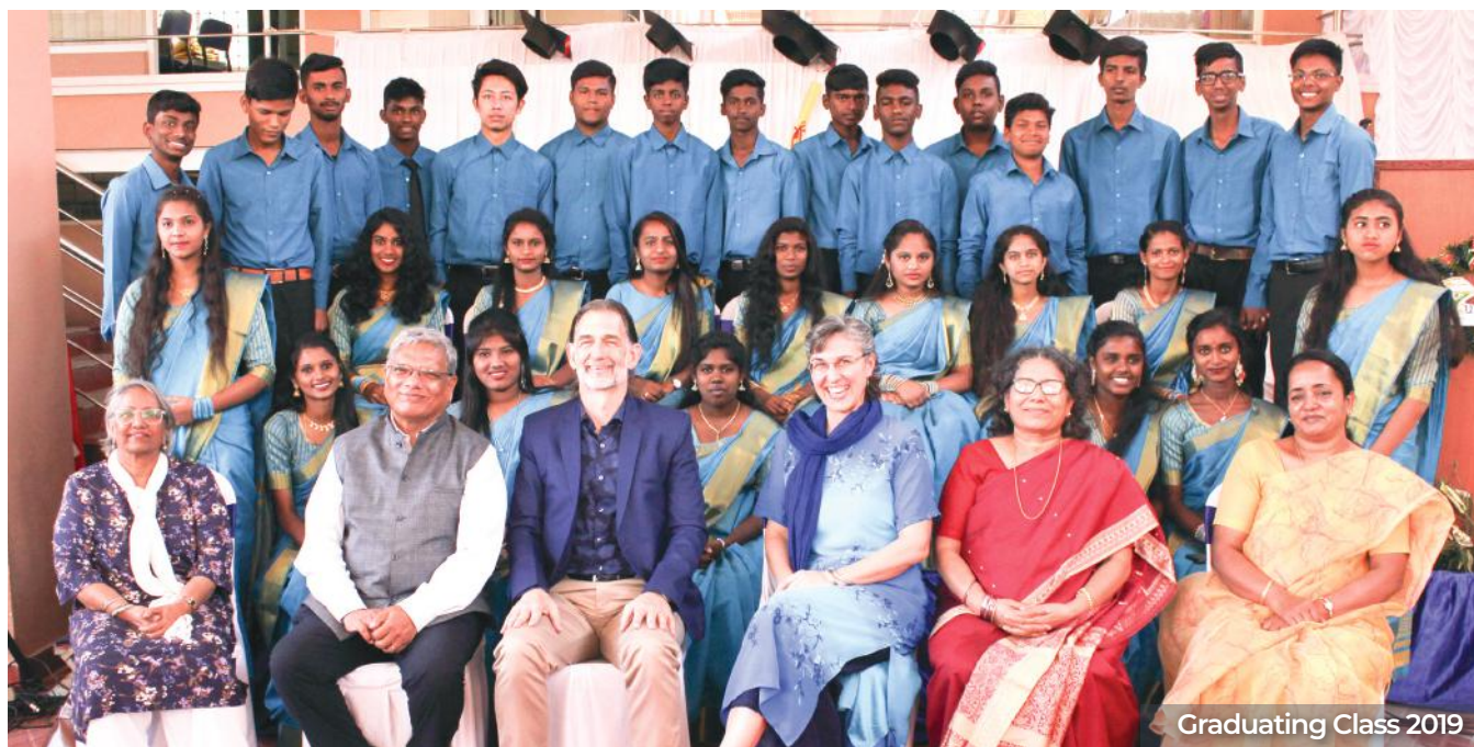
Graduating Class 2019