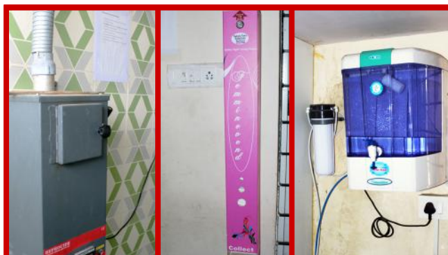
Incinerator, Sanitary Napkin Vending Machine & Water Purifier

sports conducted by Target each year which brings a lot of excitement and motivates our students to participate and win prizes. The management, staff and students express their sincere thanks to Target Corporation for being a solid support these many years with YuvaLok. Your investment in the lives of these underprivileged children has paid off richly to their communities as we see progressive transformation economically and socially.