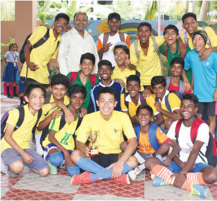
YuvaLok High School Football Team