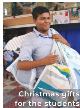
Christmas gifts for the students