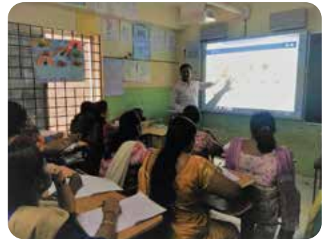
Teachers Training Using Smart Board