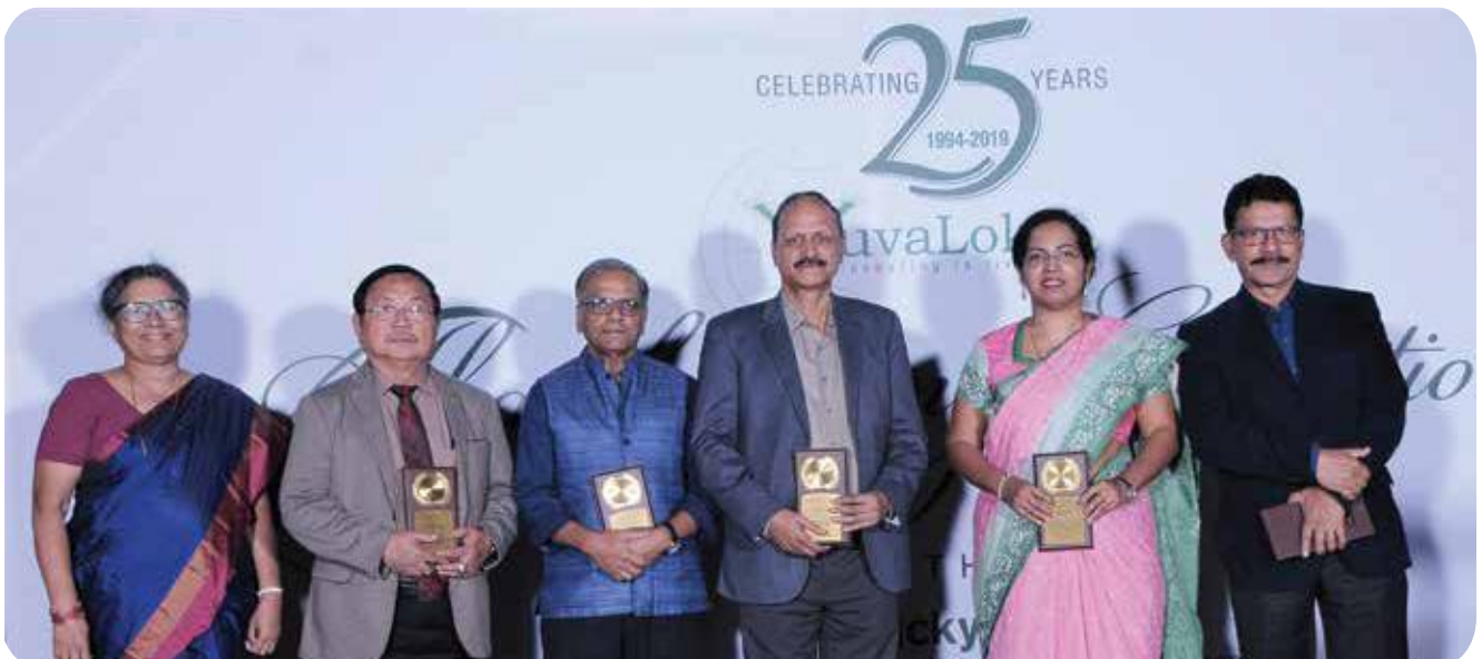
Longtime Supporters of YuvaLok Foundation

Over the years, hundreds of individuals from a variety of fields and walks of life have partnered, volunteered, and supported YuvaLok – and this event stood as an occasion to thank our donors, patrons and supporters.