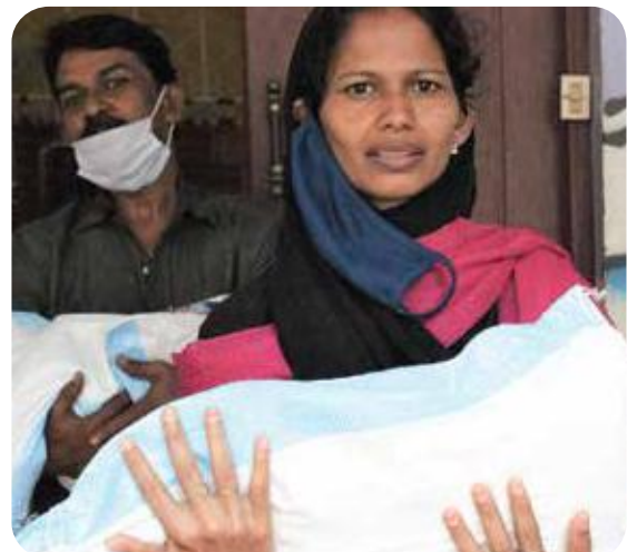
Parent holding dry ration kit