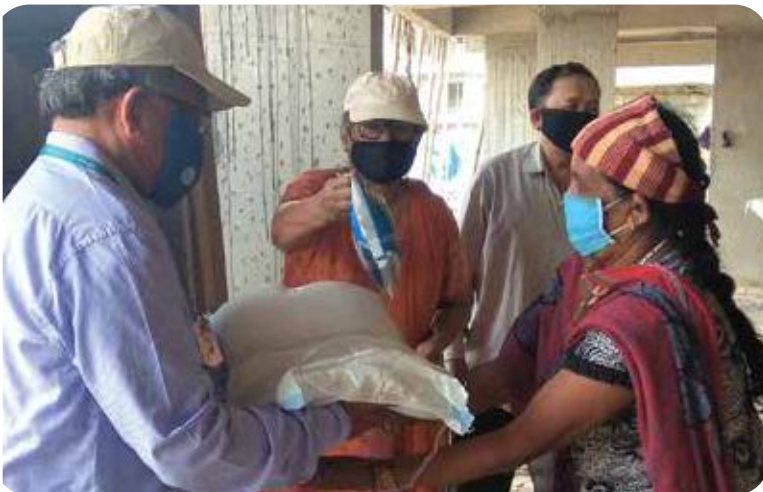
Distributing Dry Ration to Construction workers