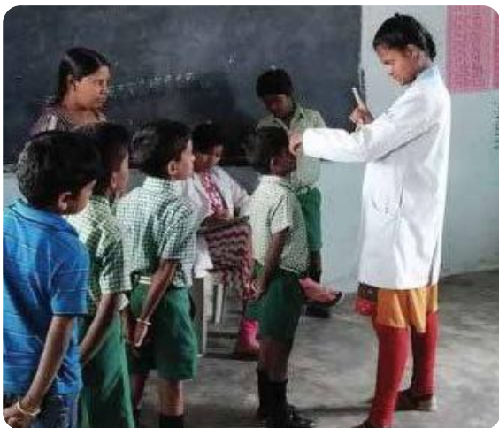
Eye Checkup by Lions International

With the effects of global warming emerging into everybody's perspective as temperatures are soaring higher and higher, students needed to be made aware of the health steps to take. With the assistance of the local health care team, students were imparted information about the benefits, usage, and procedure of making ORS or Oral Re-hydration Solution. A self-Hygiene awareness program was also conducted to make students aware of the usage of the toilet and the importance of hand-washing so that they become the flag bearers of healthy changes in their societies.