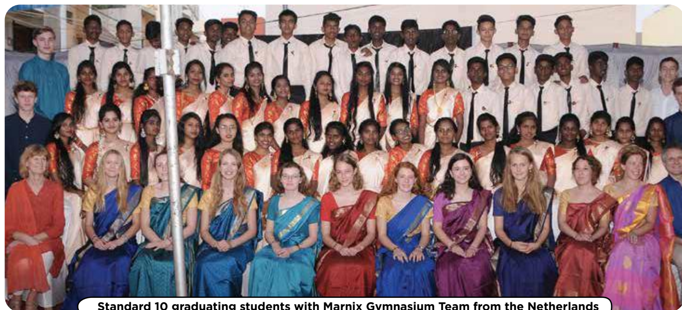
Standard 10 graduating students with Marnix Gymnasium Team from the Netherlands