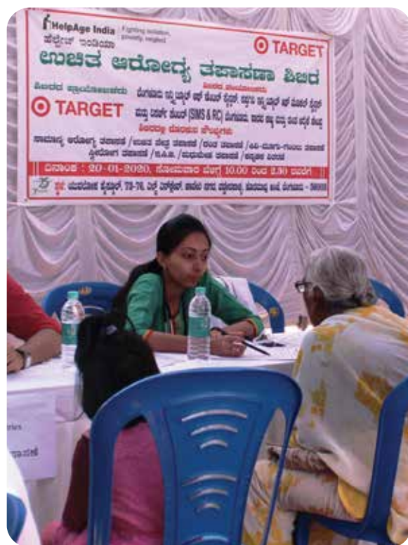
Multi-Speciality Health Check-Up

Target India staff visited our High School in December at Hennur and had a half-day session for students on hygiene and a separate session for girls from Std 6 and above on the subject. The girls were all given a pack of sanitary napkins. Target staff also distributed a hygiene kit to all the students and for each class a large hand sanitizer bottle along with liquid soap. This came at the right time as 2 months later in February the COVID 19 pandemic hit and these were put to good use.