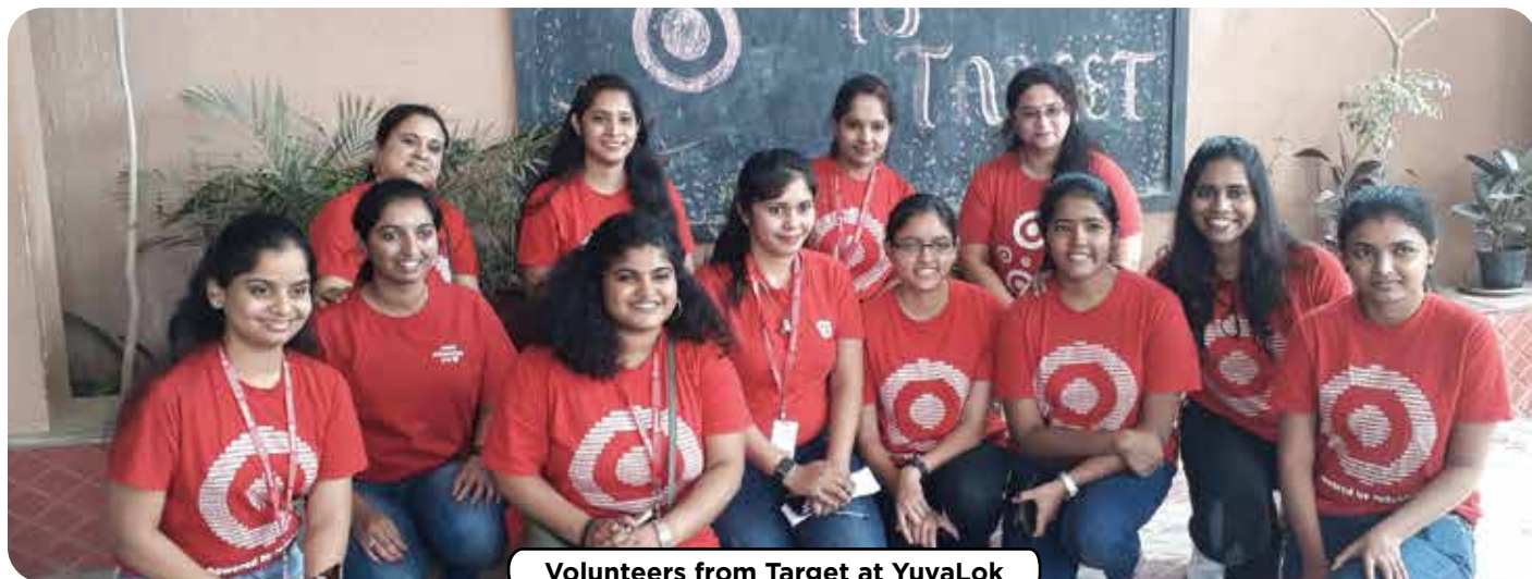
Volunteers from Target at YuvaLok